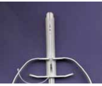
Figure 1. Small ruminant CIDR

The progesterone CIDRs for small ruminants are sold in the US. Pfizer Animal Health has obtained a minor species drug designation from the FDA for both the Progesterone EAZI-BREED<sup>TM</sup> CIDR® Sheep and Goat Inserts which means they have several years of marketing exclusivity upon FDA approval of these CIDRs. Official approval has been granted for sheep but not yet for goats. The testing required for approval is ongoing. There are other hormonal controls in the form of feed additives (melengestrol acetate